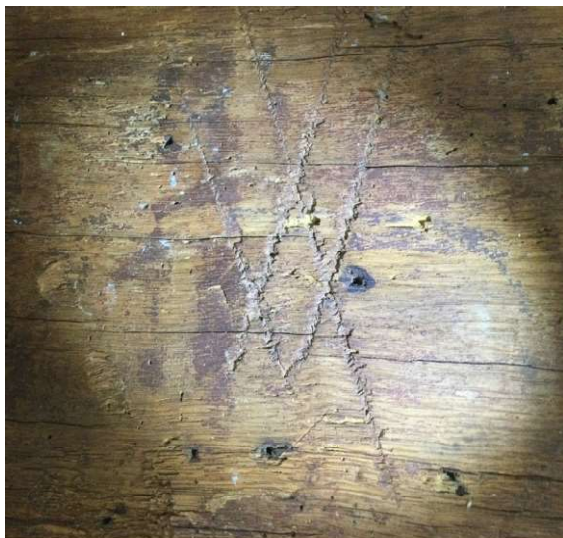
Marian Cult Image, Whitneys Farm House

chamber. Shining a torch transversely along a timber can make the mark more obvious as in the photographs below.