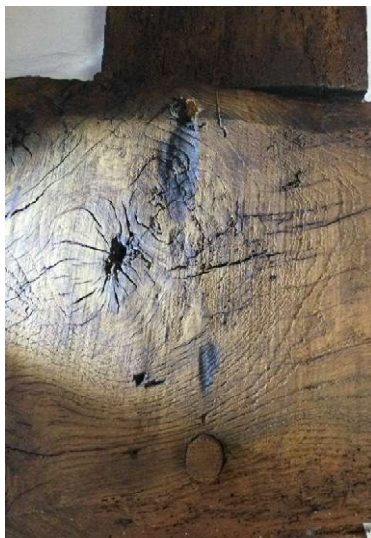
Taper burn mark, Whitneys Farm House

Finally, as at the Venture In, a burn or scorch mark where a deliberate burn has been made by candle or taper into the timber can also ward off witches and spirits. Again, these usually appear under windows or adjacent to doors.